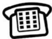
Using the phone

You should be able to use the telephone in private especially if you need to talk to your social worker or the Children's Rights Officer.