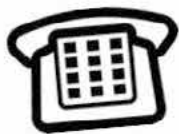
Using the phone

You should be able to use the telephone in private especially if you need to talk to your social worker or the Children's Rights Officer.